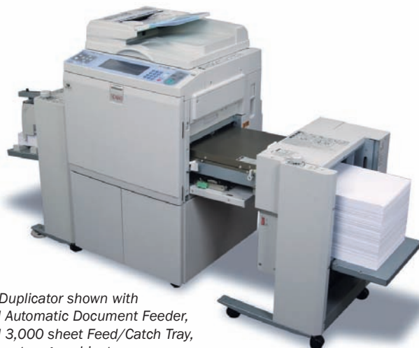
SD460 Duplicator shown with optional Automatic Document Feeder, optional 3,000 sheet Feed/Catch Tray, and base storage cabinet.