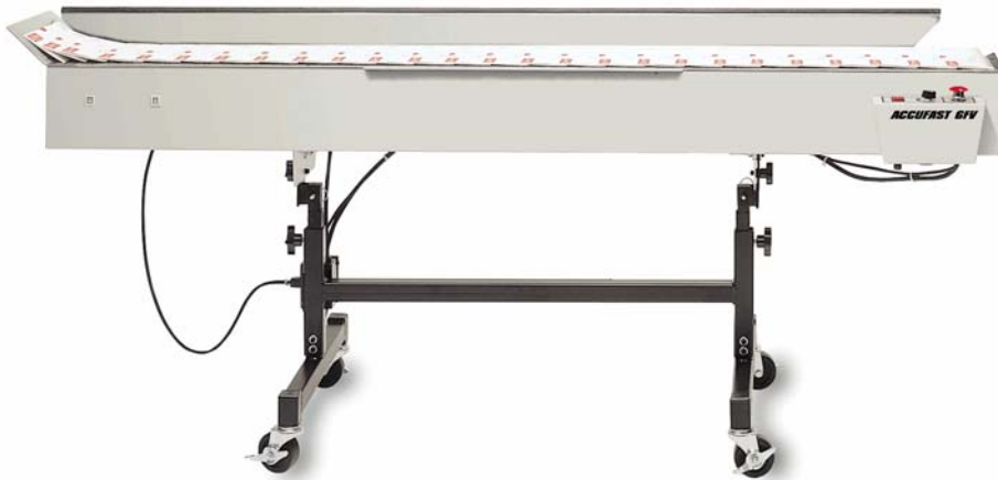
The ACCUFAST 6FV Conveyor

The ACCUFAST 6FV is, as its name implies 6 feet long. It is sold only as a free standing unit that can be rolled up to many different mailing machines. The 6FV has a single wide belt and can be used straight on or at right angles to its input device.