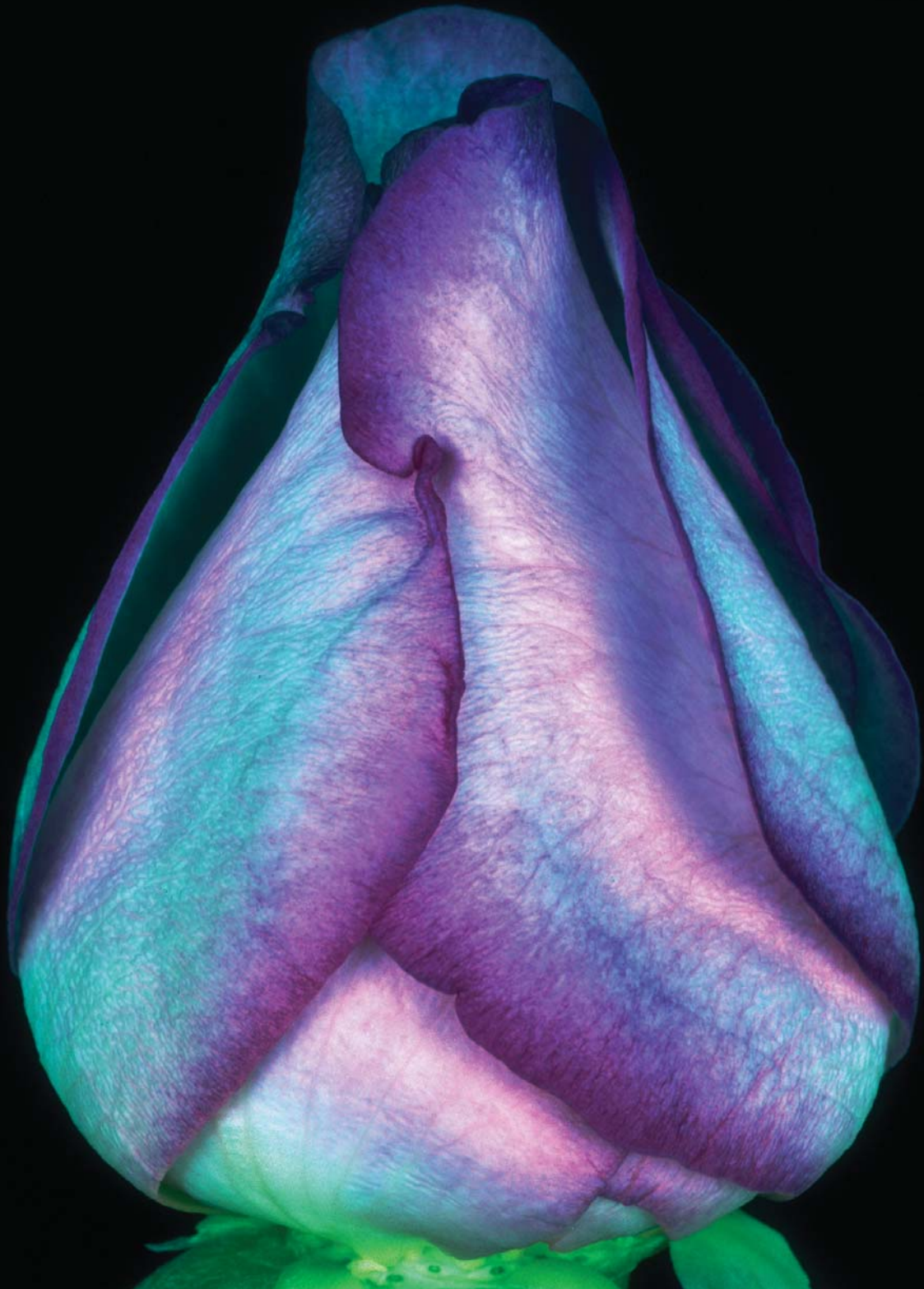
Tea Rose