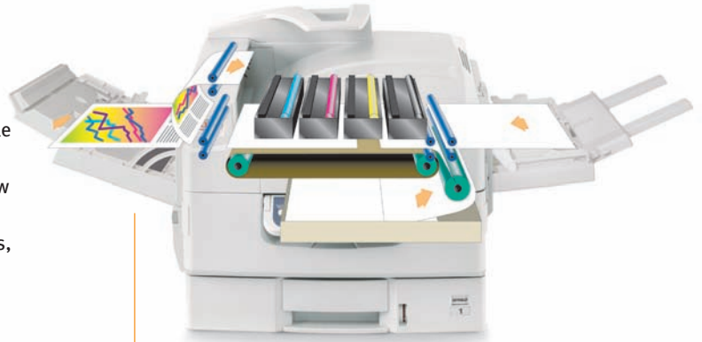
Single Pass Color™ technology and straight-through paper path handles thick paper stock and banner sheets.

The pro905DP from OKI Printing Solutions: high capacity and high quality—the right Digital Press for your demanding, color-sensitive short-run printing needs.